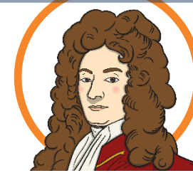
Sir Christopher Wren